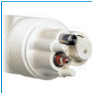
Platinum ORP (Gold ORP also available)

The Ryton sensor is best suited for measuring strong base solutions of more than 12 pH at elevated temperatures. It can also be used in acidic solutions, but is not recommended when aromatic hydrocarbons are present.