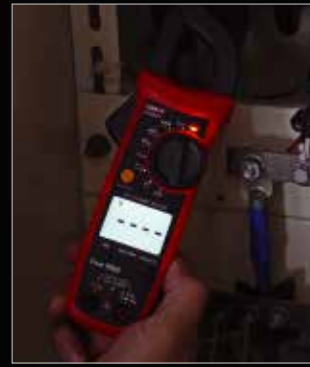
NCV multi-segment display and audio/visual alarm