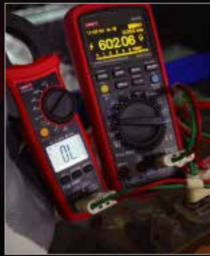
600V protection across all range