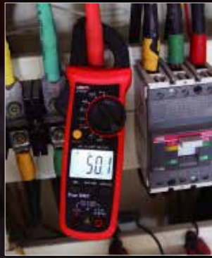
High voltage (600V) frequency measurement