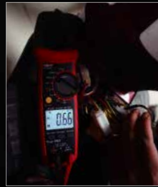
Small range measurement, accuracy guarantee range 1%-100%