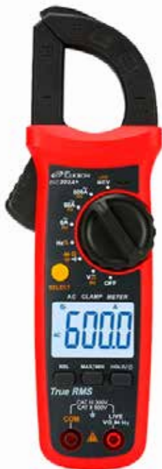
ELC202A+ (AC current only)