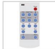
Remote Control All functions can be realized with it, making the operation much easier and more convenient.