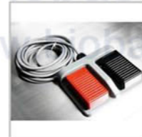
Foot Switch Adjust front window height by foot during experiment, to avoid airflow turbulence caused by arm movement.