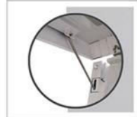
Iron hook support rod for panel support