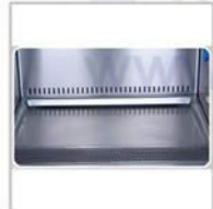
Work Zone Work zone, made of 304 stainless steel, is surrounded by negative pressure.