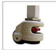
Footmaster Caster Universal caster with brake and leveling feet.