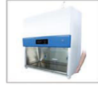
Cabinet Support Block Easy to lift, prevent hand pressing