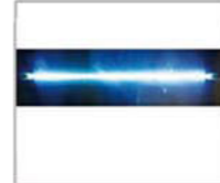
UV Lamp Emission of 253.7 nanometers for most efficient decontamination.